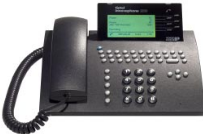
innovaphone IP200 Telefon mit integriertem VoIP Recording